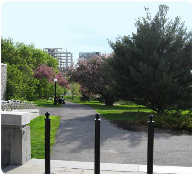
View from east side looking west at one of the entrances to the site.