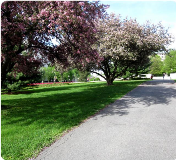
View of site from west side facing east along a pedestrian pathway.