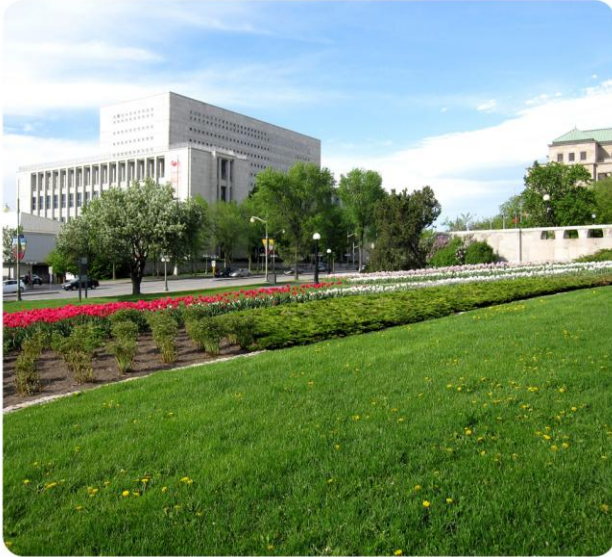
View looking out from site toward Wellington Street.