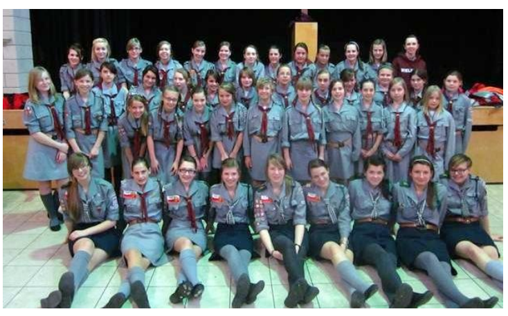
Druzyna Zrdlo, Druzyna Strumien and Druzyna Nurt, Szczep Wieliczka - Mississauga

The Polish Girl Scouts Association troop "Wieliczka" made up of instructors/leaders, rangers, girl scouts, brownies and sparks is contributing $500 towards the memorial in honour of all the scouts that contributed to the freedom and solidarity of Poland.