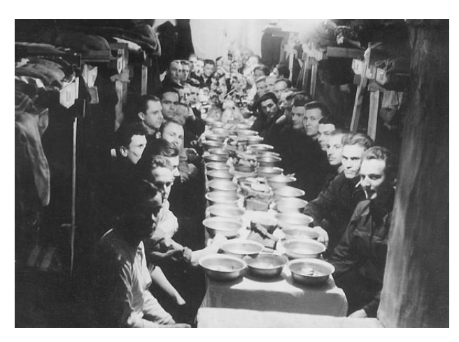
Christmas Eve in the Gulag 1955

On this holy night earth and heaven shine, In this night the heart and stars commune, And enmity fades, each loves the other, 'And o'er the stillness warm wings hover'. On this night your footsteps glimmer; This night transfigures doubt to hope; This night must banish every sorrow, And teach you to forgive and love. On this holy night, in this holy night, On this holy night, each loves the other; On this holy night, in this holy night, On this holy night, each loves the other. On this night the gates of heaven open, Above earth's darkness burn the stars, And on each person's head this night The Lord in blessing lays His hand.