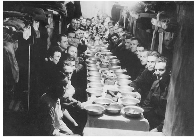
Christmas Eve in the Gulag 1955

On this holy night earth and heaven shine, In this night the heart and stars commune, And enmity fades, each loves the other, 'And o'er the stillness warm wings hover'. On this night your footsteps glimmer; This night transfigures doubt to hope; This night must banish every sorrow, And teach you to forgive and love. On this holy night, in this holy night, On this holy night, each loves the other; On this holy night, in this holy night, On this holy night, each loves the other. On this night the gates of heaven open, Above earth's darkness burn the stars, And on each person's head this night The Lord in blessing lays His hand.