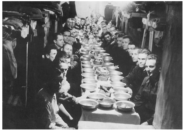
Christmas Eve in the Gulag 1955

On this holy night earth and heaven shine, In this night the heart and stars commune, And enmity fades, each loves the other, 'And o'er the stillness warm wings hover'. On this night your footsteps glimmer; This night transfigures doubt to hope; This night must banish every sorrow, And teach you to forgive and love. On this holy night, in this holy night, On this holy night, each loves the other; On this holy night, in this holy night, On this holy night, each loves the other. On this night the gates of heaven open, Above earth's darkness burn the stars, And on each person's head this night The Lord in blessing lays His hand.