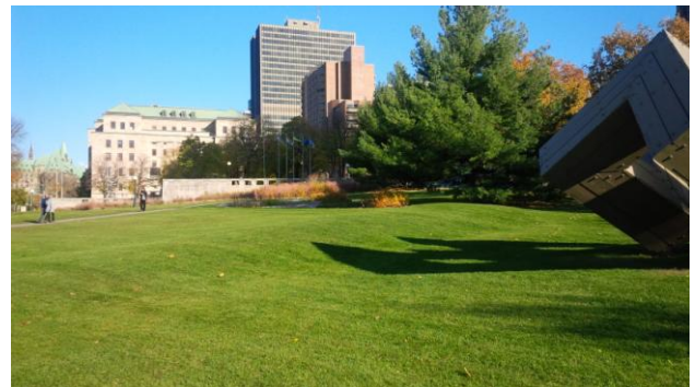
Memorial site at the Garden of the Provinces and Territories.

The group visited the memorial site at the Garden of the Provinces and Territories to enable the finalist teams to see where the memorial will reside and where hundreds and maybe even thousands will eventually gather to commemorate their ethnic heritage and struggle against Communism while celebrating their past, present and future in Canada.