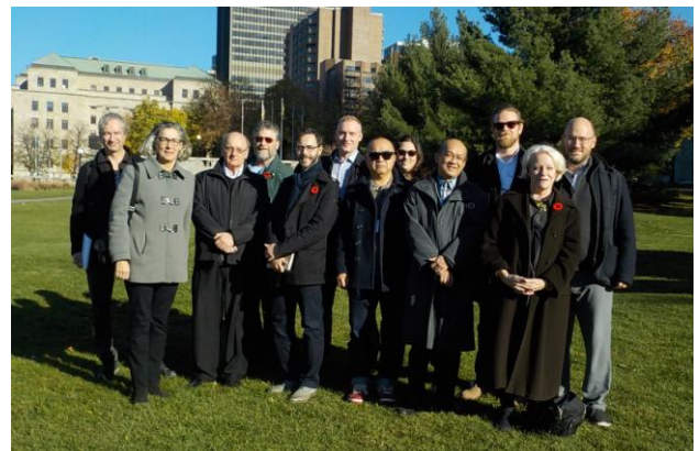
Design competition finalists.